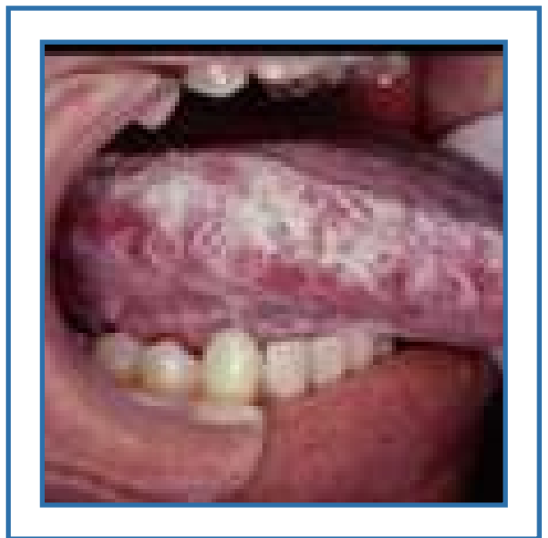
Oral hairy leukoplakia